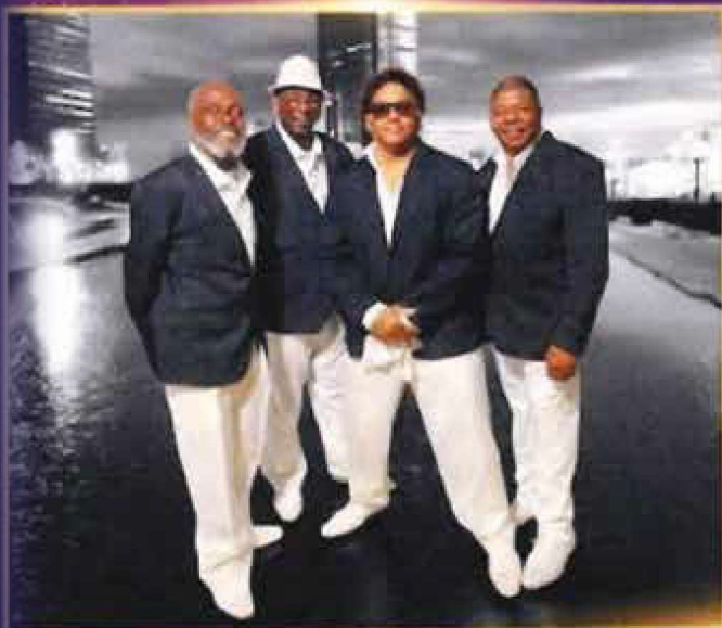
THE NU MEN OF SOUL CLASSIC SOUL MUSIC