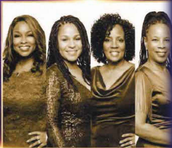
RARE ELEGANCE Vocal Female Group