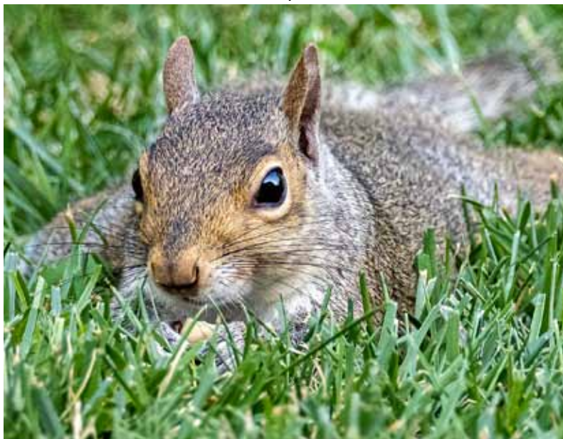
Relaxing with a snack.

SENIOR PUBLISHING COMPANY accepts advertisements and advertisements are based upon information provided by the advertiser. SENIOR PUBLISHING COMPANY does not independently investigate the accuracy of advertisement content and does not warrant or represent the accuracy of the content of any advertisement.