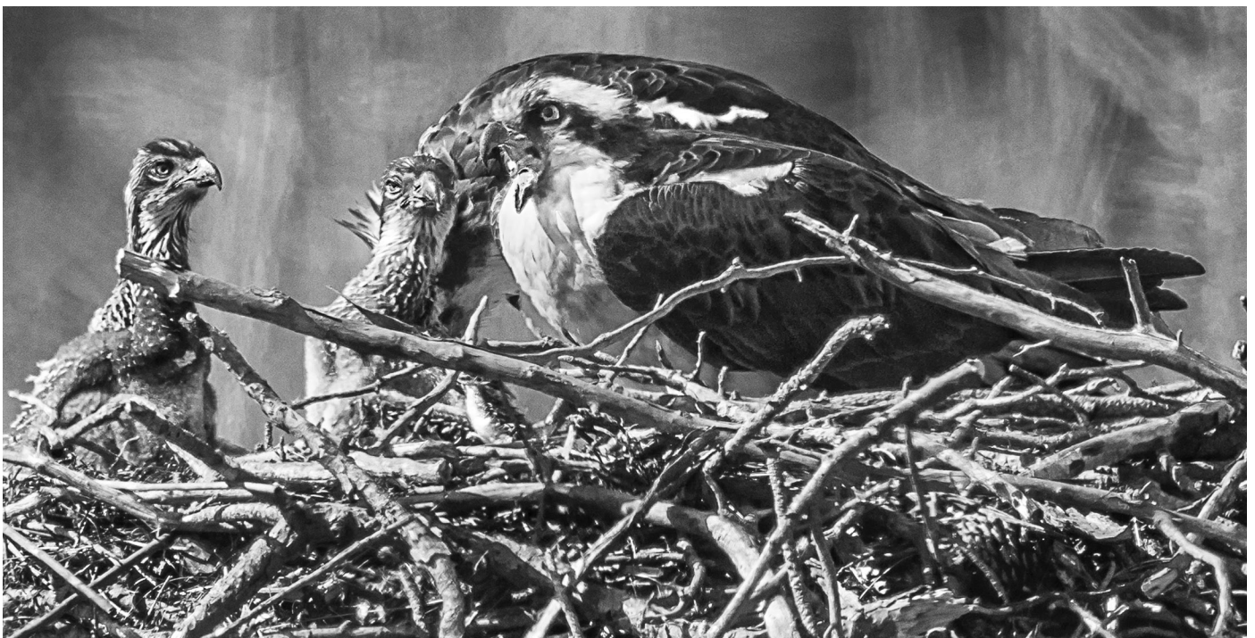
Mom, stop screaming in my ear! Osprey nest at Cattus Island County Park.